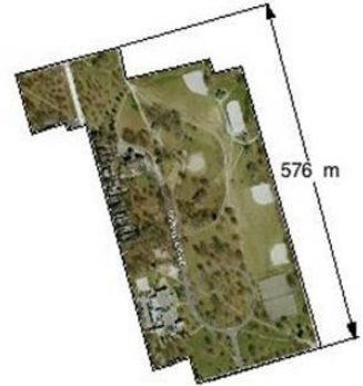
TRINITY BELLWOODS PARK 16 HECTARES