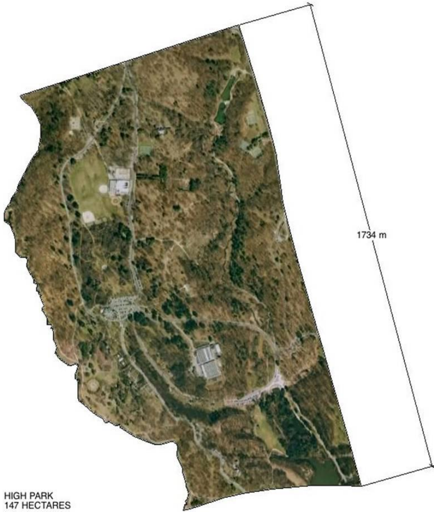
HIGH PARK 147 HECTARES